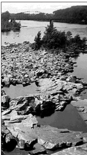
from the archives: A visit to Chippewa Falls, Wi. on a GSM Field Trip Sept. 1939.