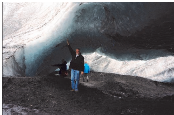
Under the glacier at Sólheimajökull

We all agreed that a most fascinating stop was Sólheimajökull, which is the snout of a glacier that is the southwestern outlet of the Myrdalsjökull icecap. Jim informed us that the terminus of this glacier has retreated many miles since he first saw it in the 1980s. The edge of the glacier had a very complicated shape, which included a number of arches under which we could walk without