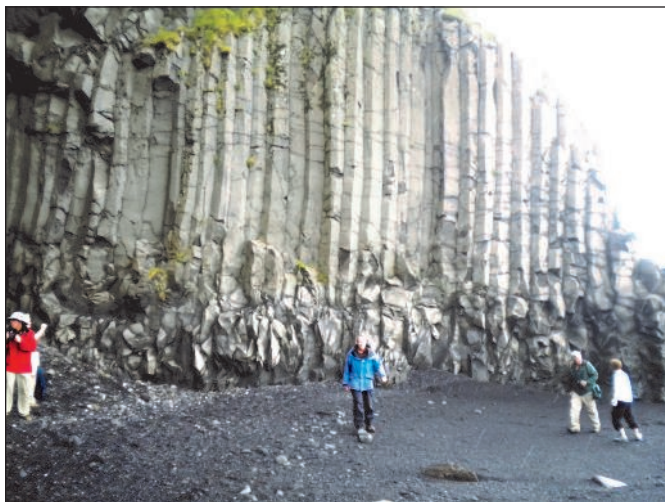
The black sand beach at Dyrhólaey with massive columns of basalt

The peninsula of Dyrhólaey is the southernmost point of Iceland. It includes a fantastic black