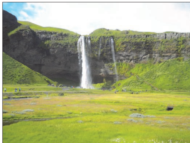
Seljalandsfoss - We walked behind this waterfall

We saw numerous beautiful and spectacular waterfalls, including one (Seljalandsfoss) which we hiked behind, but I'll describe only the most unusual: Hraunfossar, which is a series of cascades that seem to flow out of solid rock. The water actually flows underground through a porous lava field and emerges where the Hvítá River has cut