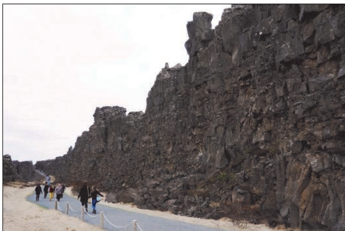
Walking along the mid-Atlantic ridge

Iceland lies on the mid-Atlantic rift, straddling the North American and Eurasian tectonic plates. As you would imagine, much of what we saw were manifestations of this tectonic plate boundary. We most vividly saw the plate boundary at Thingvellir (Þingvellir) National Park, a UNESCO World Heritage Site. We walked through the graben where the tectonic plates are diverging. This graben is the result of the land being thrust down,