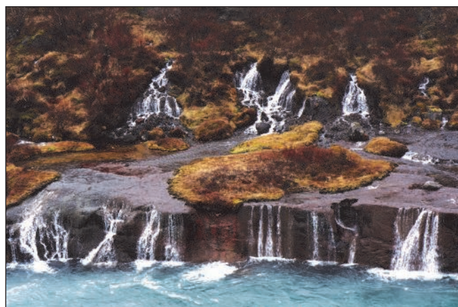
Hraunfossar cascades from the lava field

through the layers of the lava field. The water pours from the rock over a stretch of about a half mile, and then cascades down into the Hvítá River.